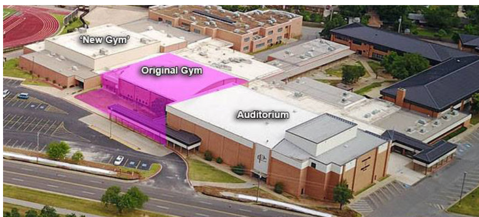
Weightroom area at PCHS. Story on Page 5.